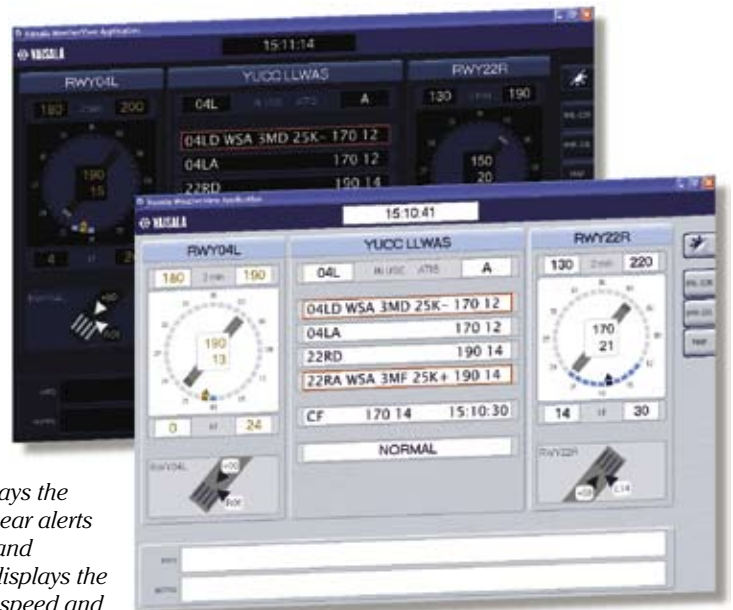
Alert screen displays the threshold windshear alerts and wind speed and direction. It also displays the center field wind speed and direction and system status.

The LLWAS can be easily upgraded to a full-scale AviMet AWOS system. The system can also be fully integrated into an existing AviMet AWOS.